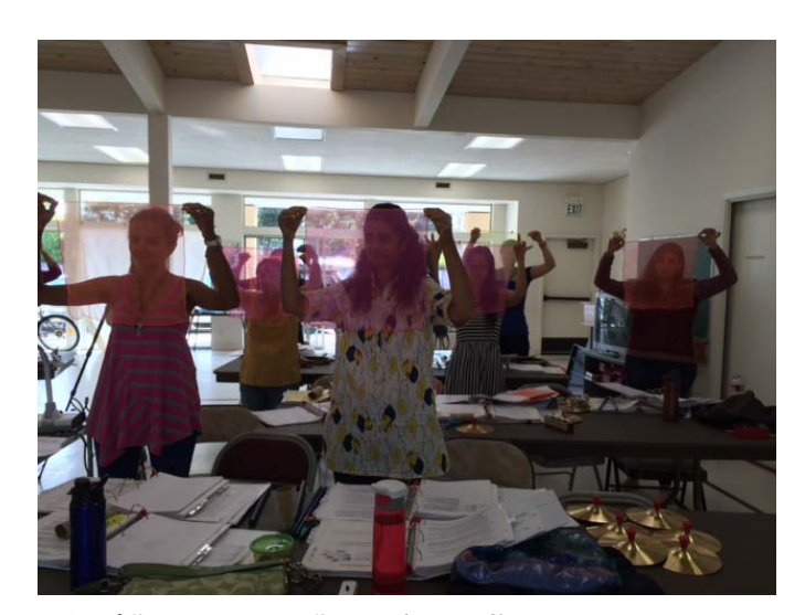
Scarf Dance - Fremont Docent Training Class

Other items: books, CDs, felt props, games, puppets, handheld signs, Music K8 magazines/CDs, Music Express magazine, McGraw Hill Share the Music series, Melody Midget charts, poster board lyrics, props and costumes.